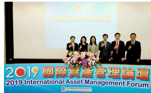
本會於5月29日舉辦「2019國際資產管理論壇」 The 2019 International Asset Management Forum on May 29 th