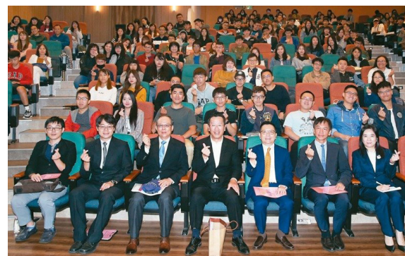
本公會於10月29日協辦金管會與經濟日報合辦之校園金融講座－中原大學場次 The Association co-organized a seminar with the FSC and Economic Daily News at the Chung Yuan Christian University on October 29 th