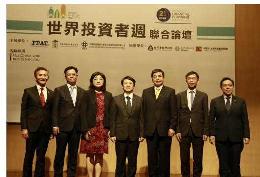
本會於10月1~2日與臺灣理財顧問認證協會及退休基金協會合辦「2019世界投資者週聯合論壇」 From October 1 st – October 2 nd , the Association, FPAT and PFA jointly hosted the “2019 World Investor Week Forum”