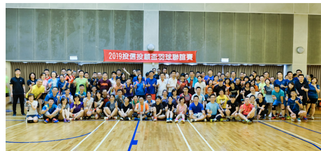
2019年投信投顧盃羽球聯誼賽 The 2019 SITE and SICE Badminton Tournament at Taipei Da-An Sports Center