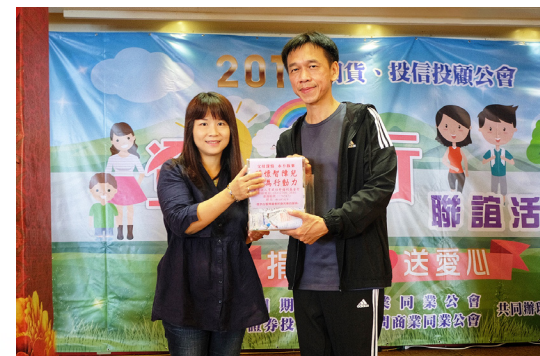
2019 年投信投顧公會、期貨公會登山健行活動 The 2019 SITCA、CNFA hiking activity