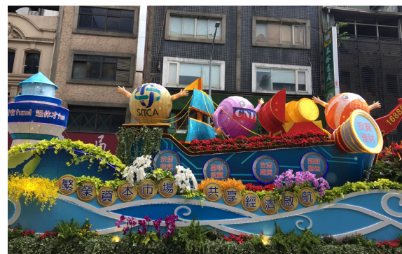
本公會參加10月10~20日「108年國慶大會花車嘉年華」活動 The Association participated in the "2019 National Day Parade Carnival" Activities from October 10 th – October 20 th