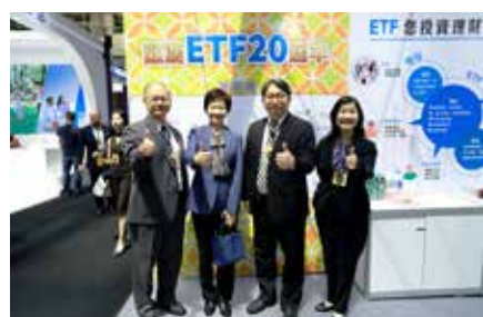
本公會於8月11日至8月12日共同設攤參與「榮耀20 ETF 啟動財富博覽會」

The Association filmed the "Start Here and Now to Prevent Investment Fraud" promotional video on May 4 th