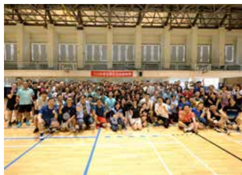
2023 年投信投顧盃羽球聯誼賽 The 2023 SITE and SICE Badminton Tournament at National Taipei University of Education

全年度共舉辦教育訓練課程 257 場次，受訓人數達 19,080 人次；其中投信投顧從業人員職前（認可證基會外訓課程）12 班次，受訓人數共計 743 人；投信投顧從業人員在職訓練 243 場次，受訓人數共計 18,337 人。