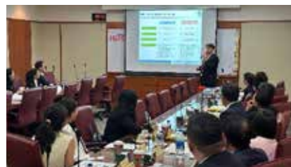
本公會於 11 月 3 日與泰國期交所、證交所董事長、總經理及其同仁進行交流 The Association exchanged views with representatives from the Stock Exchange of Thailand and the Thailand Futures Exchange on November 3 rd