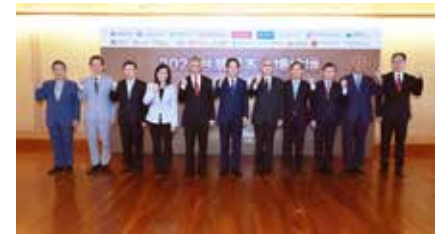
本公會於 10 月 11 日與 10 月 27 日共同舉辦「2023 台灣資本市場論壇」

From October 4 th - 6 th , the Association co-organized the the "2023 International Asset Management Forum II"