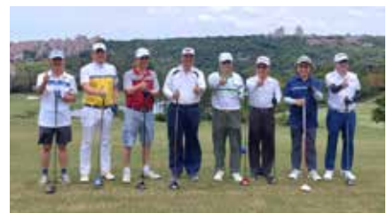
2023 年證券期貨盃高爾夫球錦標賽 The 2023 Securities and Futures Golf Championship at the Yangsheng Golf Club

為加強證券、期貨、投信投顧業者及週邊單位之情誼，本公會與六大證券、期貨週邊單位於 5 月 6 日假桃園揚昇高爾夫球場共同舉辦「2023 年證券期貨盃高爾夫球聯誼賽」，活動當天聚集了 149 位高爾夫球好手踴躍參與。