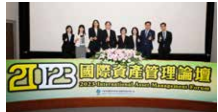
本公會於 6 月 14 日舉辦「2023 投信投顧公會國際資產管理論壇 I」

The Association held the "2023 International Asset Management Forum" on June 14 th