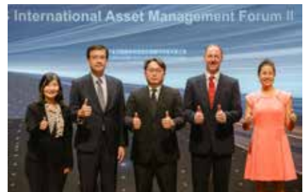
本公會於 10 月 3 日合辦「2023 投信投顧公會國際資產管理論壇 II」

The Association held the "2023 International Asset Management Forum" on June 14 th