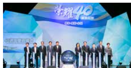
本公會於12月1日舉辦「投信投顧產業40週年感恩晚會」

From October 6 th – December 29 th , the Association held the "Correct Financial View of Mutual Funds Lecture Tour" in colleges and universities